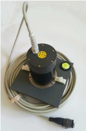
LEMI-424 3-Component analogue Magnetometer