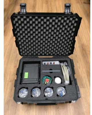
LEMI-424 system full set layout (left); LEMI-424 system in transportation case (right)